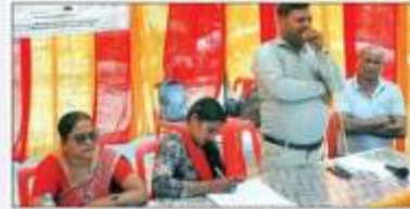
विश्व जल दिवस जनजागरूता कार्यक्रम में मौजूद लोगों को लक्षित करी सौराजी टैपकल कालीन