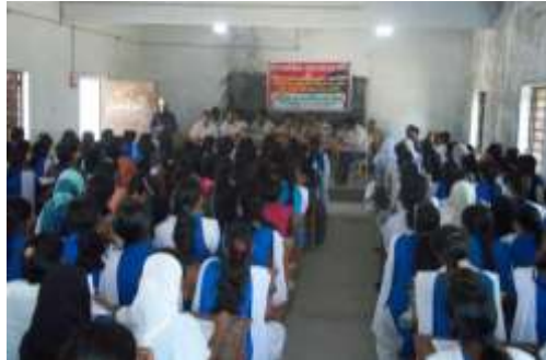
Awareness Generation on Trafficking in Schools