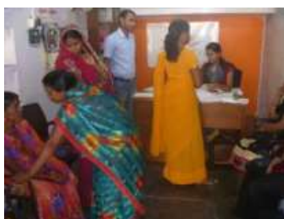
Counseling given by counselor in IUCD –Day at Surya Clinic