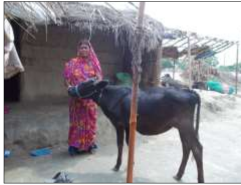
Income Generation provided to survivors by MSEMVS