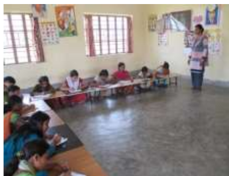
Educational class I