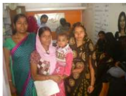
Clients and PE after service receiving in IUCD Day at Surya Clinic